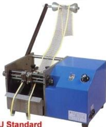
RFT-201U Standard RFT-201S Slim RFT-201W Heavy Duty RFT-201F Vertical Lead forming